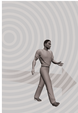
ULTRASONIC (U/S) TECHNOLOGY